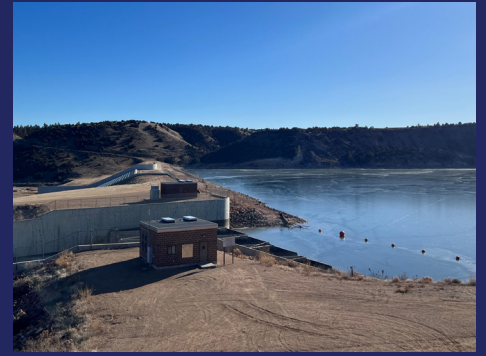
Adjudication Status - February 2024