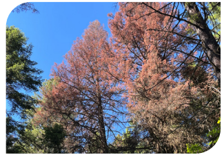
Red crown after infestation

Douglas-fir beetle targets mature, fire-scorched, diseased, drought-stressed, wind-thrown or otherwise compromised Douglas-fir. Other bark beetles can attack smaller trees but rarely cause widespread damage. Adults attack Douglas-fir in mid-May, bore into the inner bark and lay eggs. Larvae take one year to develop into adults which then emerge and attack new trees the following spring.