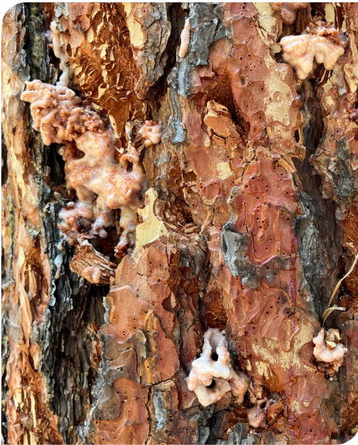
Pitch tubes created by red turpentine beetle attacks