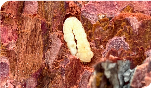
Wood borer larva