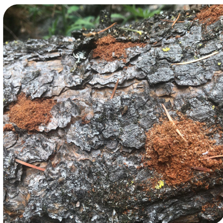
Boring dust accumulated on infested logs