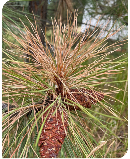
Diplodia in ponderosa pine tip