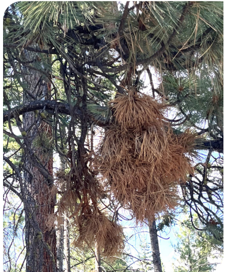
Elythroderma in ponderosa pine