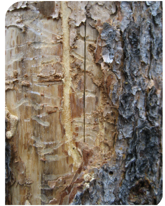
Mountain pine beetle gallery

Mountain pine beetle and western pine beetle are two different species of bark beetle that attack ponderosa pine in western Montana. Mountain pine beetle also attacks other pine species, including lodgepole. Bark beetles mass attack by sending a chemical message that rallies additional beetles to overwhelm a single tree. They bore under the bark where they lay eggs, and then larvae excavate distinct galleries as they feed. Within a year, larvae develop into adults and attack new trees. Trees generally die within a year of a successful attack.