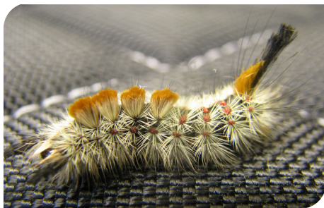
Douglas-fir tussock moth caterpillar