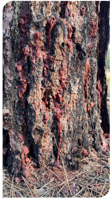
Red turpentine beetle pitch tubes