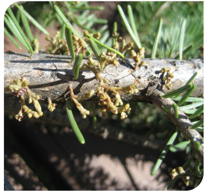
Dwarf mistletoe plant close-up