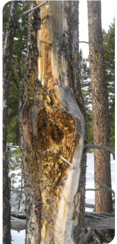
Hip canker caused by western gall rust