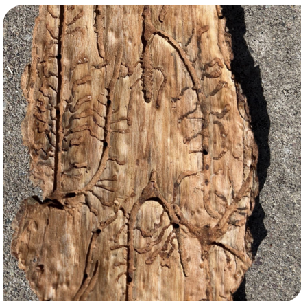
Distinct galleries created by pine engravers