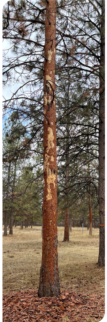
Bark of wood borer-infested tree flaked off by woodpeckers

Thin stands to promote vigor in residual trees.