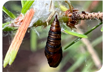
Western spruce budworm pupal case