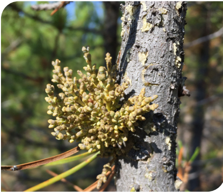
Dwarf mistletoe plant