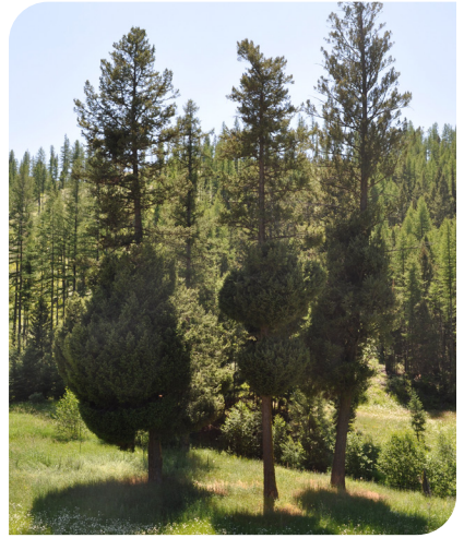
Characteristic brooming pattern of dwarf mistletoe