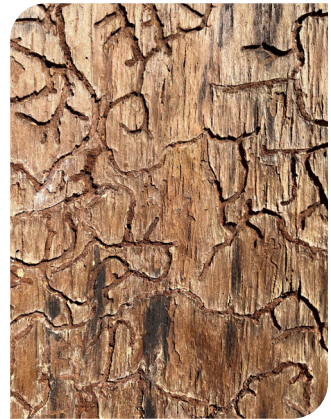
Western pine beetle gallery