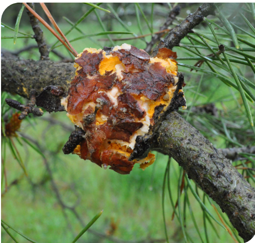
Sporulating western gall rust on pine