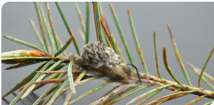
Douglas-fir tussock moth pupal case and egg mass