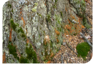
Boring dust accumulating at base of infested tree