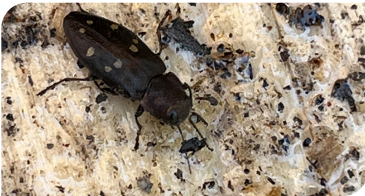
Metallic wood borer adult