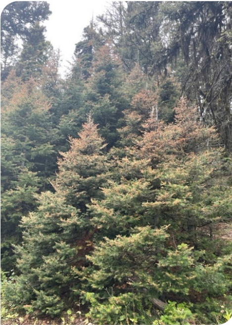
Western spruce budworm defoliation damage