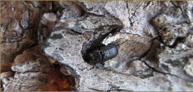
Mountain Pine Beetle

Most tree species in Montana are attacked by at least one type of bark beetle. Adult bark beetles seek appropriate hosts, bore under the bark, and excavate distinctive egg galleries. Boring dust, a mixture of sawdust and frass, accumulates in bark crevices and serves as an indicator of successful attack. Some tree species also respond to attack by producing masses of pitch. Thinning stands to reduce competition and increase residual tree vigor can mitigate bark beetle impacts in a stand. Identifying and removing infested trees can also reduce the population of beetles, but it's imperative that infested logs and firewood are removed from the stand.