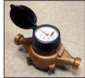
Figure 2: Water use meter.