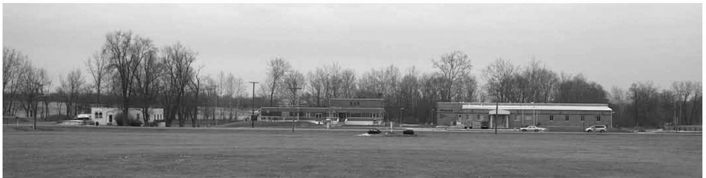
Three generations of drinking water treatment plants in Hillsboro, Ohio

Contractors will typically do whatever the owner requests, even when it is wrong.