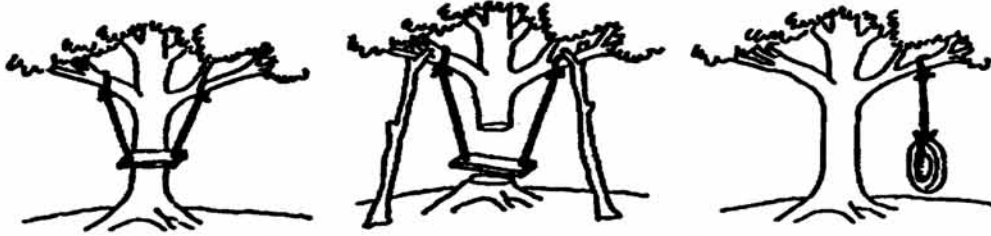
As shop fabricated it