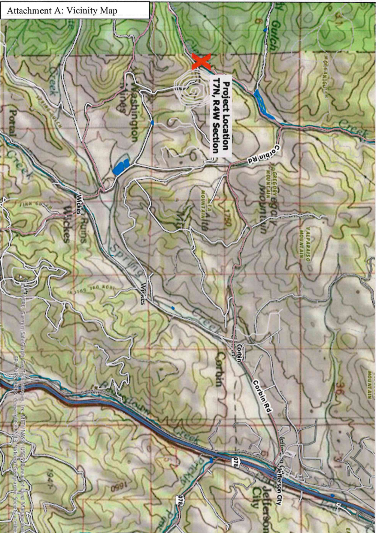
Attachment A: Vicinity Map