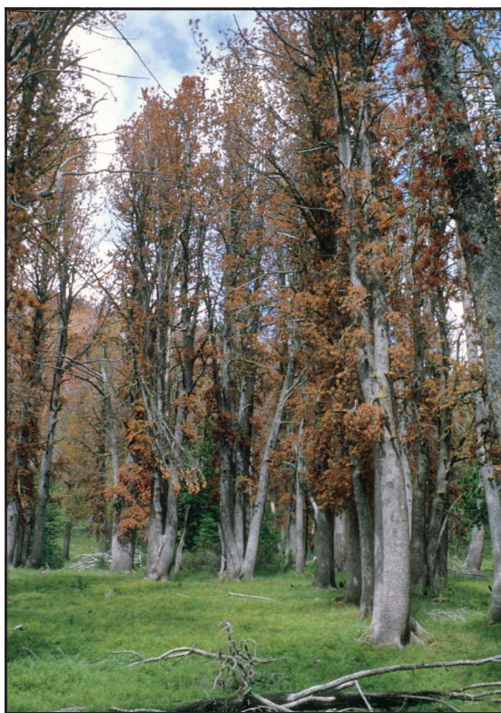
Mountain pine beetle-killed whitebark pine in Yellowstone National Park, 2004.

Mountain pine beetles can reproduce in all species of pine within their range. Outbreaks often develop in dense stands of large-diameter (>8 inches), older (>80 years-old) lodgepole pine and dense stands of mid-sized (8-12 inches diameter) ponderosa pine. When weather is favorable for several consecutive years, severe outbreaks can occur in high-elevation stands of whitebark and limber pine. Widespread outbreaks develop over several years and can result in millions of dead trees. Periodic losses of high-value, mature sugar and western white pine are less widespread, but also serious.