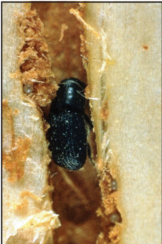
Figure 7. Mountain pine beetle adult and eggs in egg gallery.