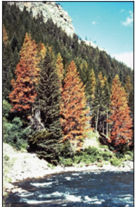
Figure 4. Fading mountain pine beetle-killed lodgepole pines. Trees generally fade 8-10 months after being attacked.