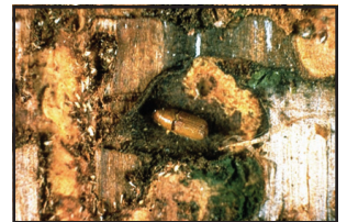
Figure 10. "Callow" or immature adults darken before emerging to complete life cycle.