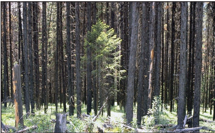
Figure 12. A “high-hazard” lodgepole pine stand, very susceptible to mountain pine beetle infestation.

Insecticides. Preventive treatments, applied before trees are infested by beetles, are an