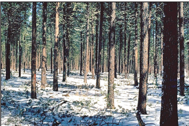
Figure 15. Silvicultural treatments offer the best long-term means of protecting susceptible stands from mountain pine beetle infestation.

Prescribed fire is an additional option for altering stand density to reduce overall susceptibility to mountain pine beetle attacks. However, sublethal heating of critical plant tissue during prescribed burns can stress residual trees, which then may be