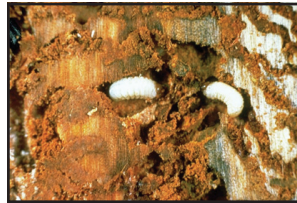
Figure 8. Mountain pine beetle larvae in feeding galleries.