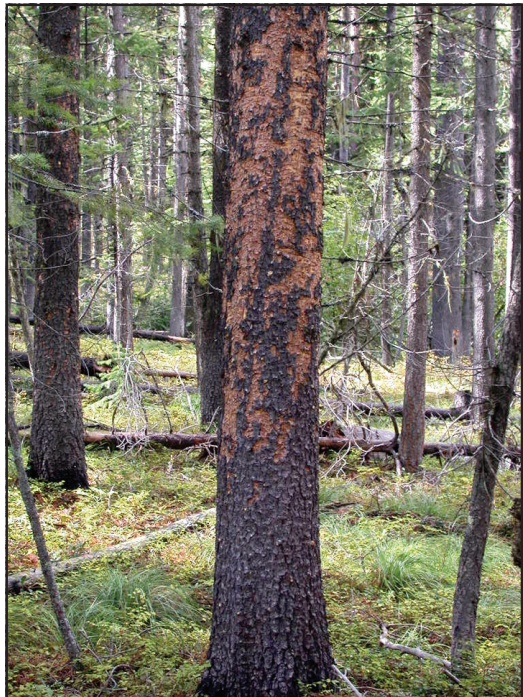
Figure 11. Woodpecker feeding on overwintering larvae typically has little effect on outbreak populations.

Competition. Mountain pine beetle larvae compete for food and space not only with each other, but with larvae of other insect species. For example, larvae of