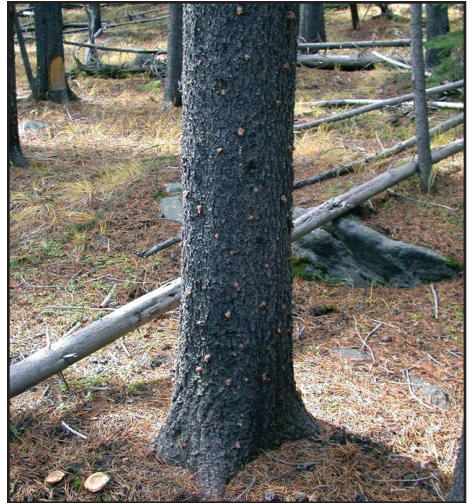
Figure 3: Pitch tubes and boring dust—indicative of a successful mountain pine beetle attack in lodgepole pine.

Needles on successfully infested trees begin changing color several months to a