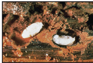
Figure 9. Larvae transform to pupae within cells constructed at end of feeding gallery.