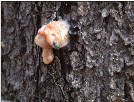
Figure 2: Unsuccessful mountain pine beetle attack—commonly called a “pitchout.”

In addition to pitch tubes, successfully infested trees will have dry, reddish-brown boring dust, similar to fine sawdust, in bark crevices along the tree bole and around the tree base (Figure 3). Infested trees may also have boring dust but no apparent pitch tubes. These trees, referred to as “blind attacks,” are more common