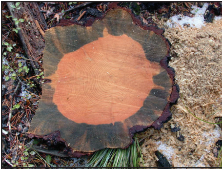
Figure 5. Blue-stained sapwood of a mountain pine beetle-killed tree.

year after attack. In unusually dry years, foliage may begin to fade within a few weeks. Needles change from green to yellowish green, then sorrel, red, and finally rusty brown (Figure 4, see page 3). Fading often begins in the lower crown and progresses upward in lodgepole pine, but may vary somewhat with other hosts. In large-diameter, tall sugar pines, for example, upper crown fading may be the first sign of an infestation.