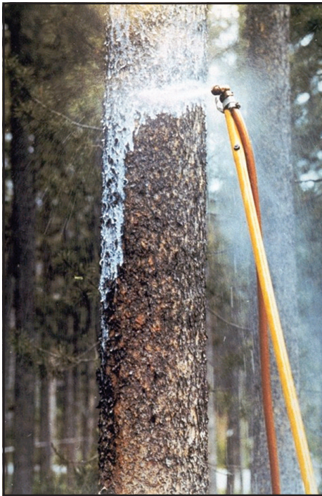
Figure 13. Preventive treatments can successfully protect susceptible hosts from mountain pine beetle attacks.

Pheromones. As noted previously, beetles produce both aggregative and anti-aggregative pheromones that are used to manipulate their populations to their advantage. Many of these “message-bearing” chemicals have been identified, and their