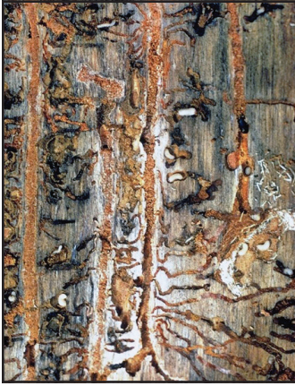
Figure 6. Mountain pine beetle egg and larval galleries.

Larvae are legless white grubs with brown heads that feed in the phloem, constructing galleries that extend at right angles to the egg gallery. Development through four larval stages (instars) is temperature dependent and therefore highly variable from year to year and site to site. The final larval instar excavates an oval cell where pupation occurs and the new adult is formed. New, immature adults spend a period of time maturation feeding on fungal spores and associated tree tissue before emerging. When several feeding chambers coalesce, adults may be found in groups, and one or more beetles often emerge from the same exit hole. Within one or two days of emerging, adults seek out and attack new trees, to resume the yearly cycle (Figures 8, 9, 10).