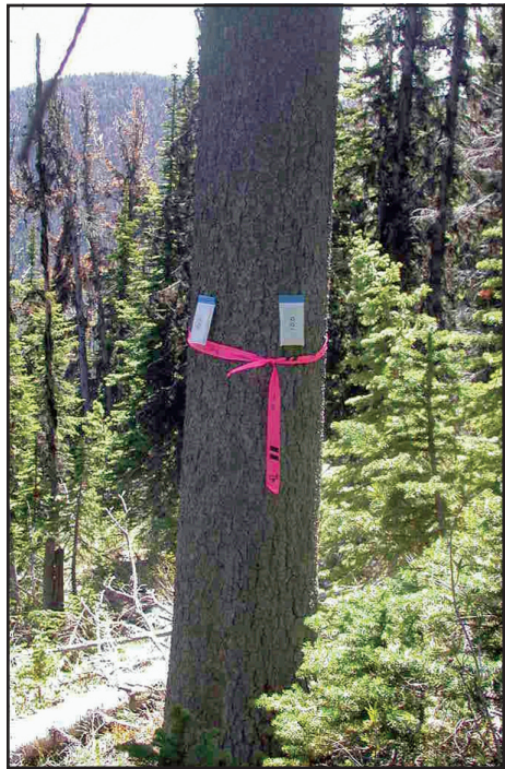
Figure 14. Verbenone can be an effective preventive treatment in some situations.

Synthetically produced pheromones are registered and periodically reviewed by the U.S. Environmental Protection