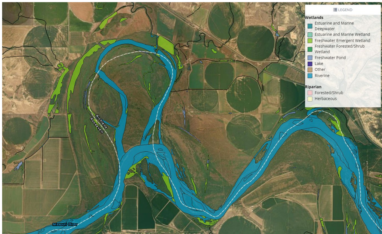
Figure 1: USFWS National Wetlands Inventory

The diversion point is adjacent to land used for agricultural purposes and has already experienced human activity. The equipment needed for the proposed use is temporary and its placement is not expected to cause substantial land disturbance.