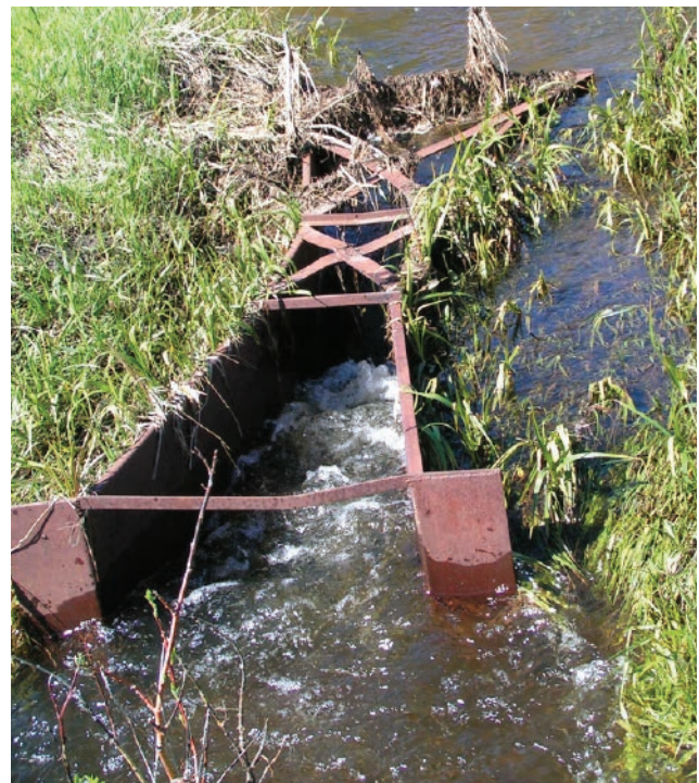
This flume is not functioning properly. It is choked with vegetation, out of level, and too small to capture the entirety of diverted flow.

preferable to keep open communication between the water user and landowner (if different). Expenses incurred for this kind of repair may be levied against the party whose infrastructure was repaired.