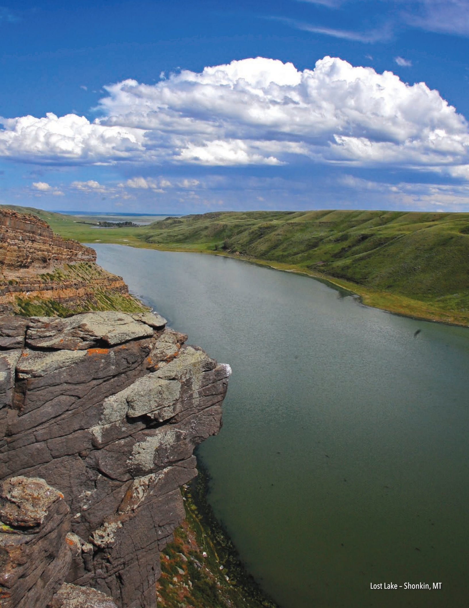
Lost Lake - Shonkin, MT