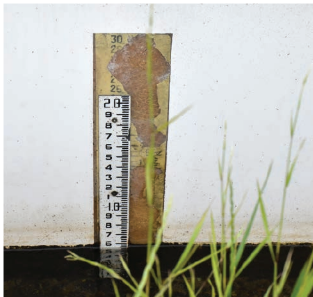
A staff gage reading at a stage of approximately 0.56 ft. The stage correlates to a flow rate using a table.