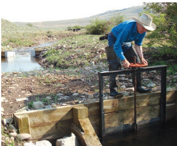
Headgates that can be closed completely, are appropriate for the volume of the diversion, and can be operated by a single person are considered "suitable."

In case of an emergency, commissioners have additional options. For example, if a headgate blows out, causing the ditch to divert the entire stream, the water commissioner has the option to repair or provide a temporary fix to the problem without notice or permission. In a case like this one, it is