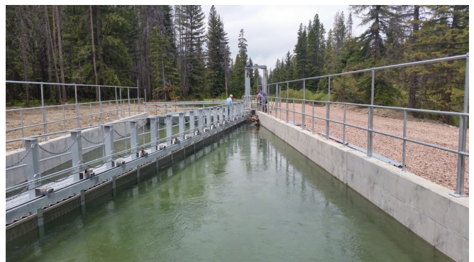
Main Canal Vertical Panel Fish Screen