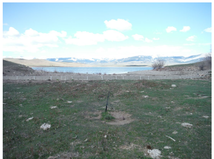
Spillway at East Dam