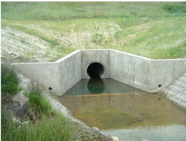
Outlet Terminal Structure at North Dam