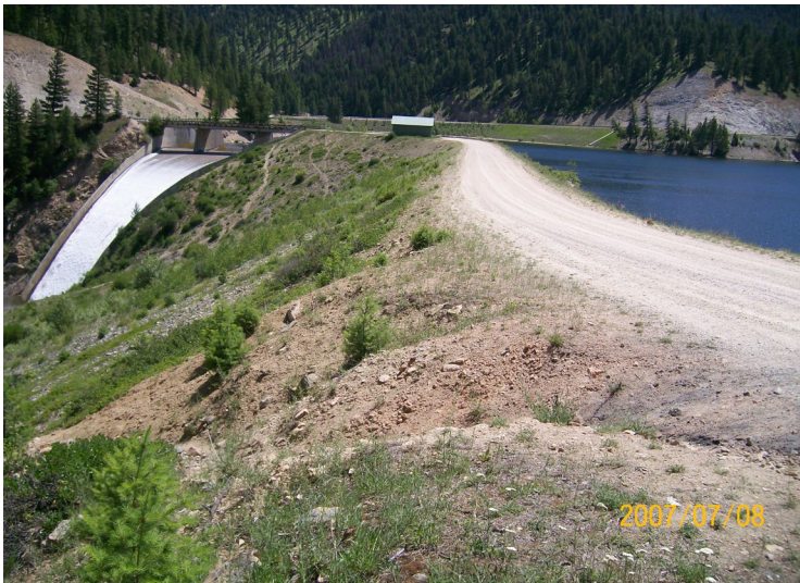
Forest Service road across dam