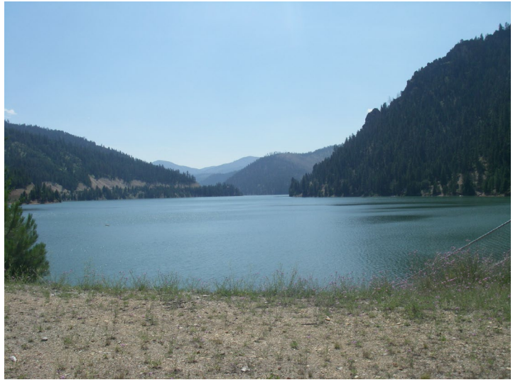
Painted Rocks Reservoir