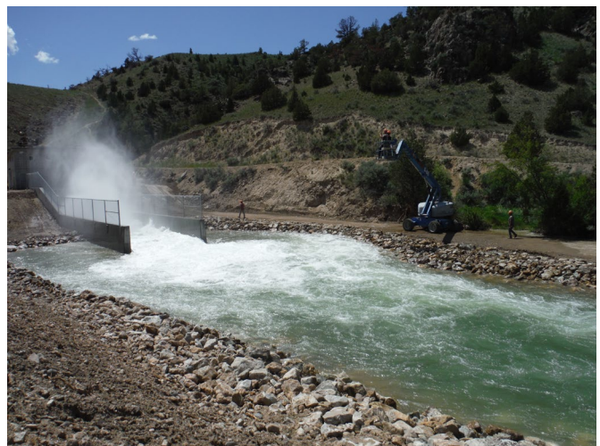
Outlet Works Operational Test