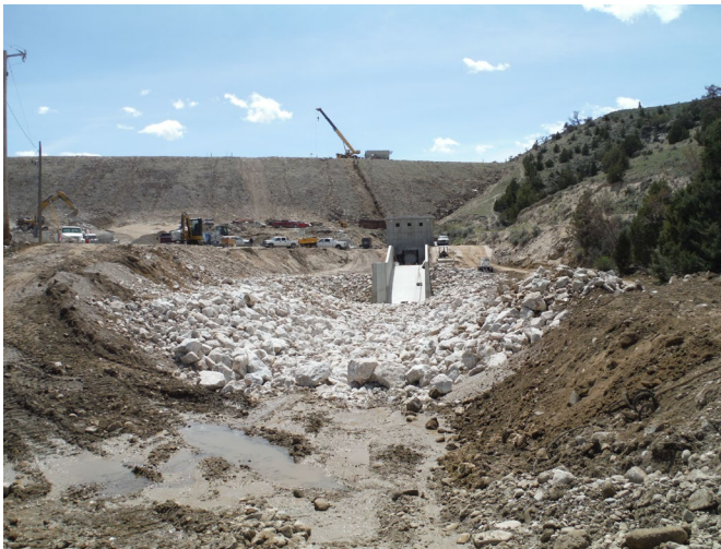
Outlet works under construction