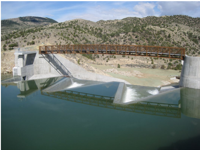
Labyrinth weir spillway and footbridge

The rehabilitation project brings the dam into full compliance with current dam safety standards. No deficiencies currently exist.