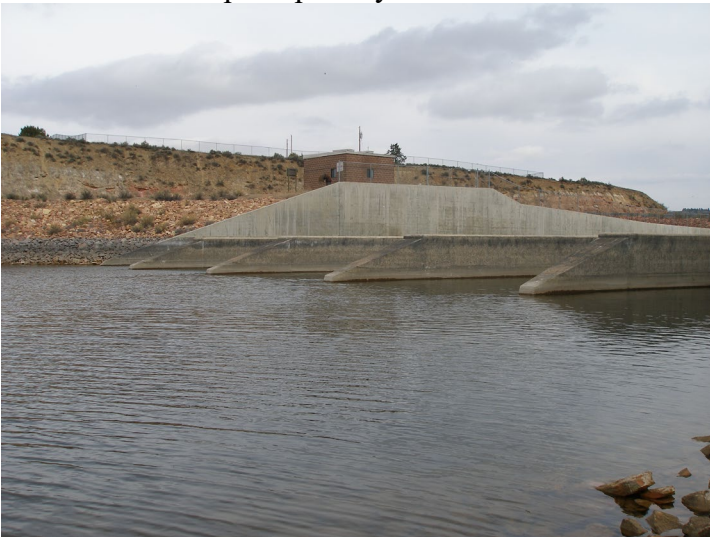
Gatehouse and top of spillway