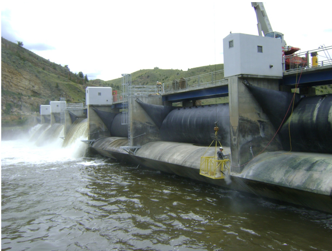
Rubber Bladder Replacement, July 2014